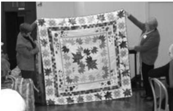
Showing Quilts at Kerang - above U3A Nunawading - U3A Kerang Quilters - below Kerang Quilters accepting quilts - below right

So, when you're next visiting or driving through flood-affected Victoria, stop off in the towns for a coffee, a meal, make some purchases – every little bit helps these communities in their recovery from these devastating floods.