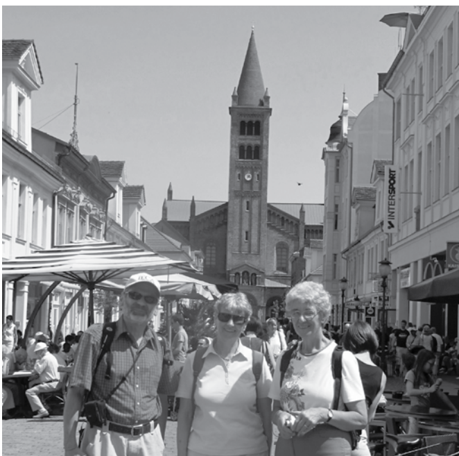
Potsdam, where we had lunch before visiting the San Souci Palace